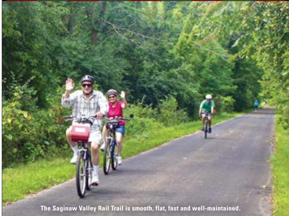
The Saginaw Valley Rail Trail is smooth, flat, fast and well-maintained.

Saginaw Valley Rail Trail • Thomas Township Trail