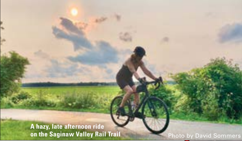
A hazy, late afternoon ride on the Saginaw Valley Rail Trail