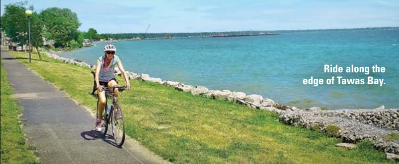
Ride along the edge of Tawas Bay.