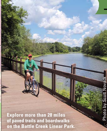
Explore more than 28 miles of paved trails and boardwalks on the Battle Creek Linear Park.